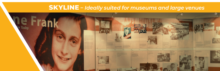
SKYLINE – Ideally suited for museums and large venues

Our most popular exhibit presents the history of the Holocaust through the perspective of Anne Frank and her family. Juxtaposing photographs of the Frank family with historical images, the exhibit shows how persecuted people were affected by the political actions of individuals and groups. Available in two sizes and adaptable to your space, the free-standing panels are presented in English and Spanish. The half-hour award winning documentary film, The Short Life of Anne Frank , is included.