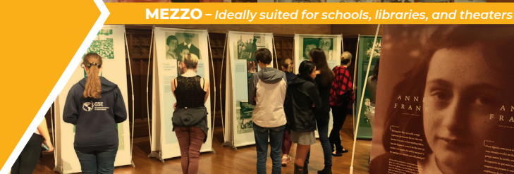
MEZZO – Ideally suited for schools, libraries, and theaters